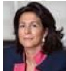
Isabel Borrego Secretary of State for Tourism/President of TURESPAÑA (Spain National Tourism Board)