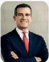
Eric Garcetti Mayor, City of Los Angeles