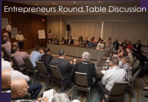
Entrepreneurs Round Table Discussion