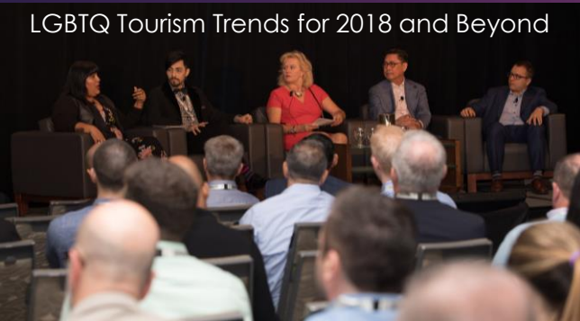
LGBTQ Tourism Trends for 2018 and Beyond