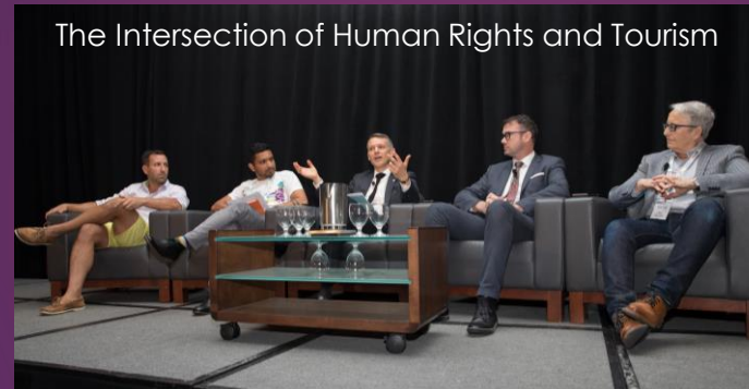
The Intersection of Human Rights and Tourism

"I have attended hundreds of conferences over the last several decades. This was the first conference that I have ever attended where I can honestly say I was awed by every session because I learned something new and substantial each time. I was also humbled by the young men and women I met who are doing amazing humanitarian work under dangerous conditions."