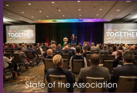
State of the Association