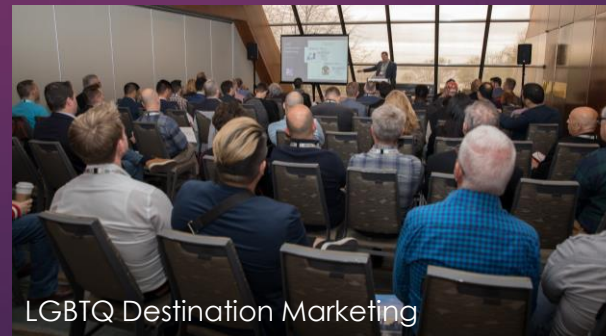
LGBTQ Destination Marketing