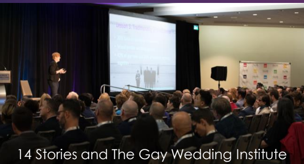
14 Stories and The Gay Wedding Institute